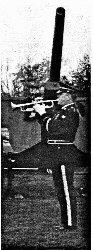
"Taps" U.S. Army Bugler